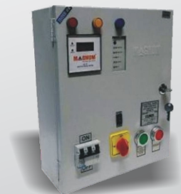
3 Phase Panels