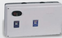
Star Delta Starters