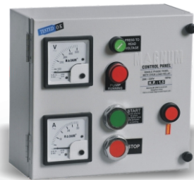
Single Phase Panels